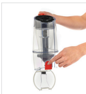
Bottom-release dirt cup